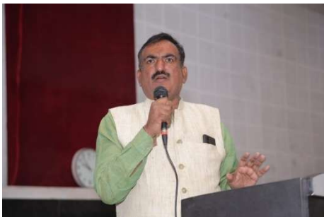
Mr. Tushar Mehta